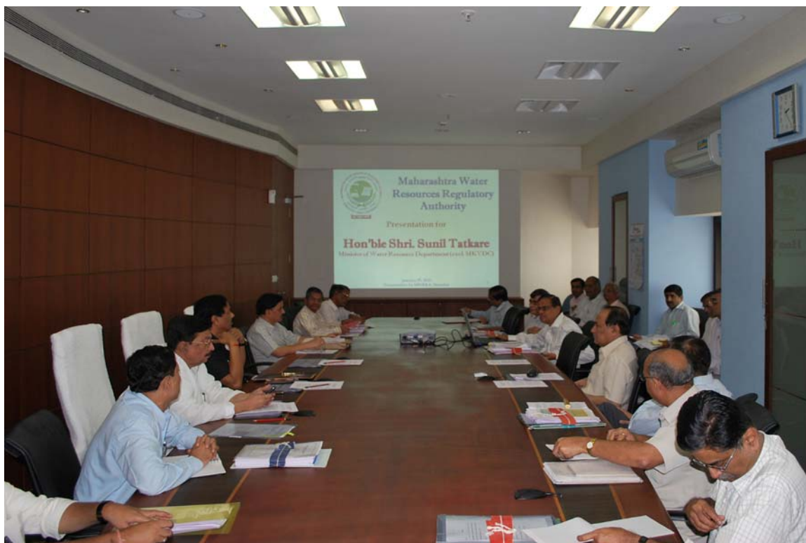
Meeting with Hon'ble Shri Sunil Tatkare, Minister for Water Resources (excluding MKVDC), Hon'ble Shri Ramraje Naik Nimbalkar, Minister for Water Resources (MKVDC), Hon'ble Shri Rajendra Mulak, Minister of State (Finance, Energy, Planning, Water Resources, Parliamentary Affairs, State Excise) Govt. of Maharashtra on 05/01/2011 in the Authority.